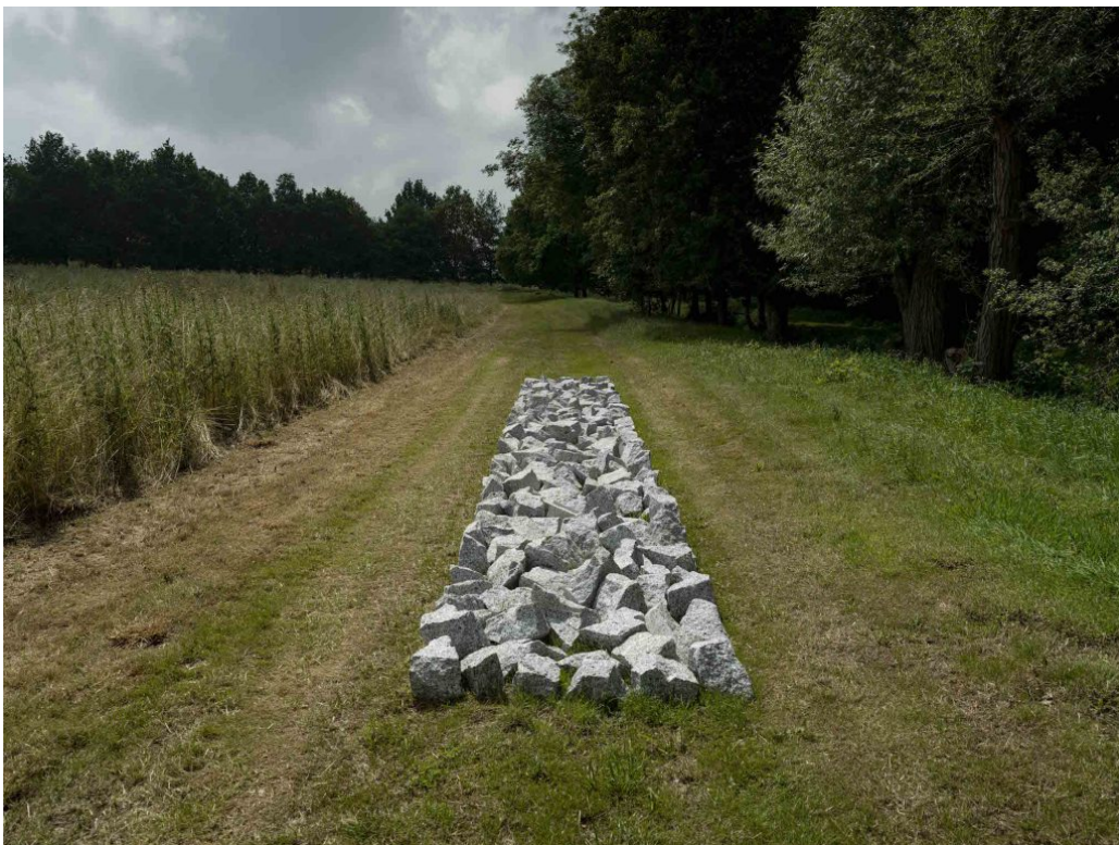
Richard Long, Ivory Granite Line (2016).