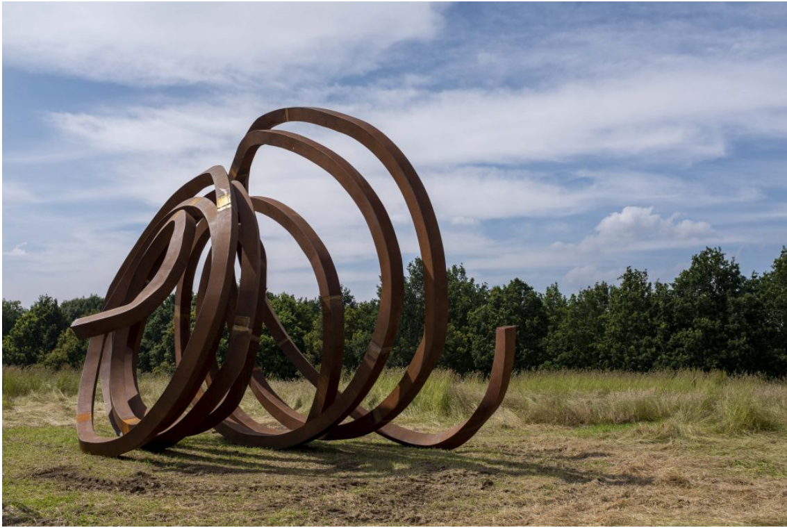
Bernar Venet, Indeterminate Line (2016–2020).