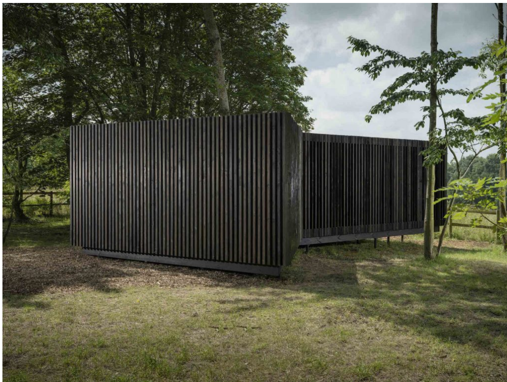
David Adjaye, Horizon Pavilion (2017).