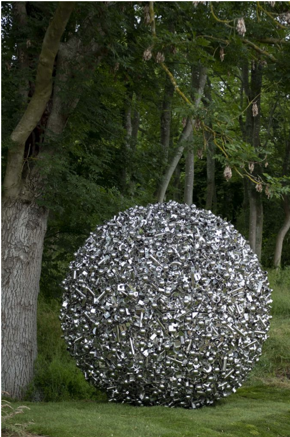
Ryan Gander, More really shiny things that don't mean anything (2012).

Follow Artnet News ( https://www.facebook.com/artnet ) on Facebook: