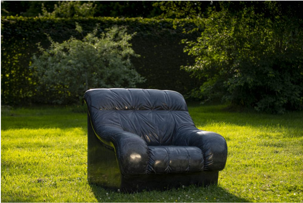
Ai Wei Wei, Sofa in Black (2011). Courtesy of Jonty Wilde, the artist and Lisson Gallery, London.